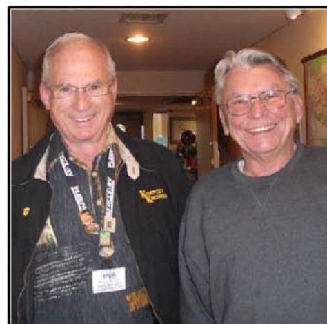
Twins at birth?