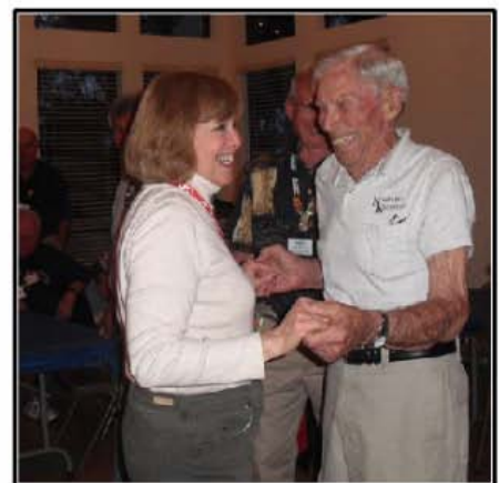
Dancing with the Stars