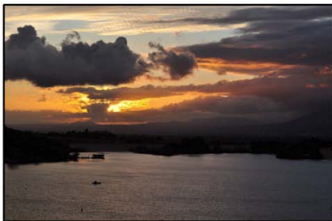
Why we love East Shore RV Park!