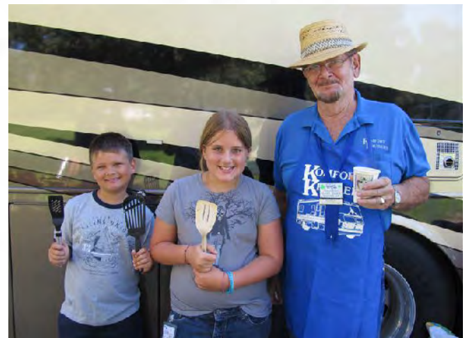
How many pancakes would you like?