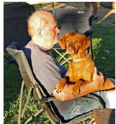
Who are all these people?