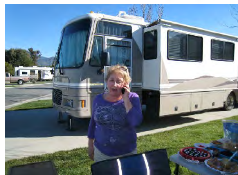
Please hurry, we're out of beer!