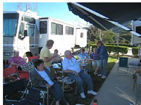
Super Bowl Party.