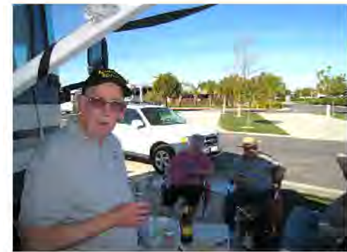
Who invited all these people?