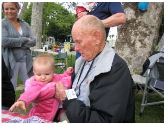
Give me a marshmallow, Grandpa