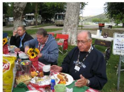
Dig in, it's really delicious!