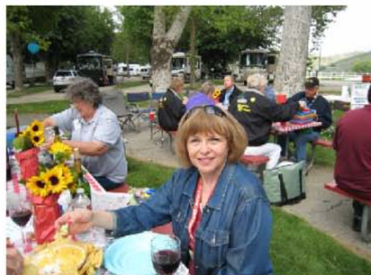
Sit down, I made enough for three.