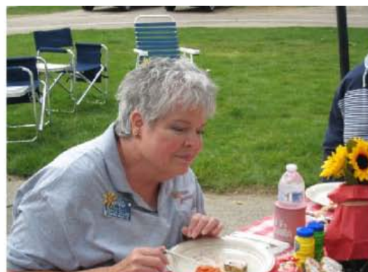
What's in that picnic basket?

When we woke on Saturday morning the trail bosses had prepared a very special breakfast. There was delicious homemade coffee cake,