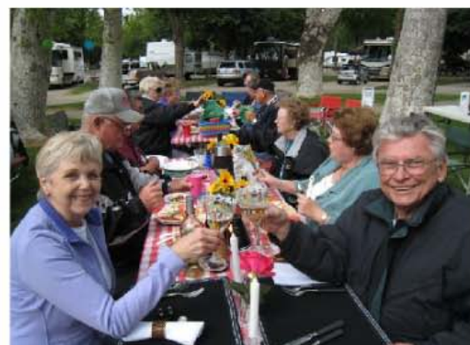
A toast to the good life!