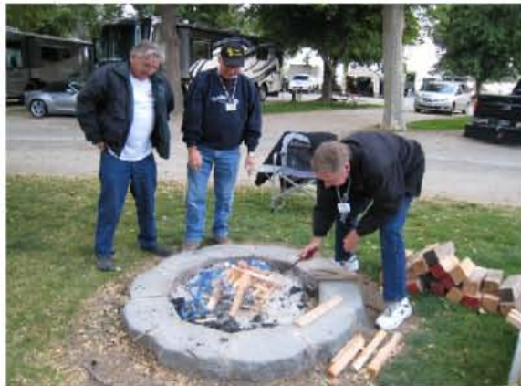
The apprentices watch carefully