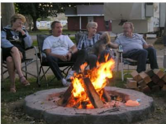
Now lets enjoy a blazing campfire!

fruit salad, and juice on the table and when you stuck your empty plate into the window of Ken and Cheryl's coach, your plate magically reappeared with Eggs Benedict on it.