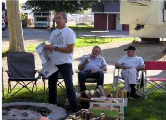
The master campfire maker begins