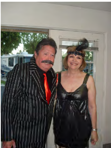
I'll make an offer you can't refuse.