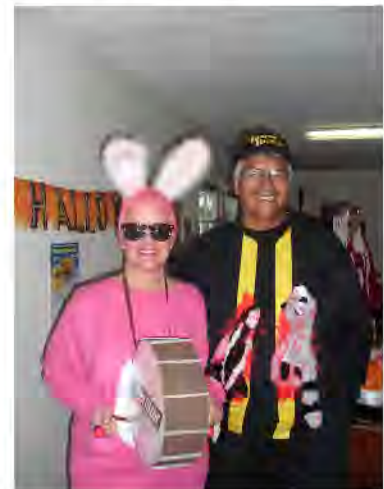
Energizer Bunny and fresh road kill