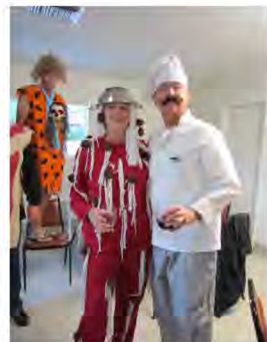
U lika my spaghetti!