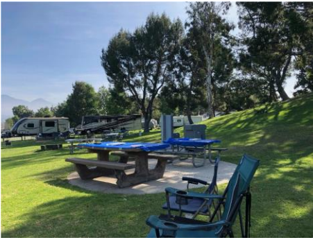
All ready for dinner