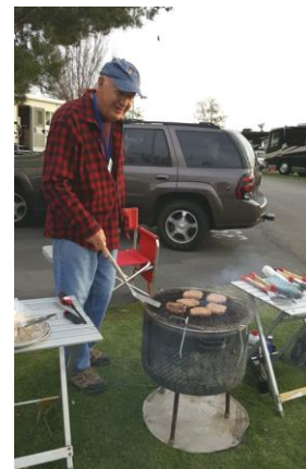
One of the cooks