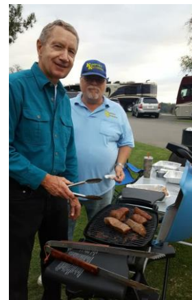
And more cooks