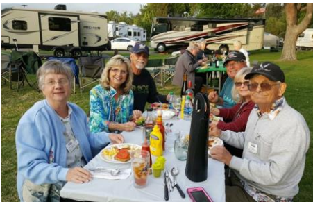
Looks like the V's and the Z's are chowing down