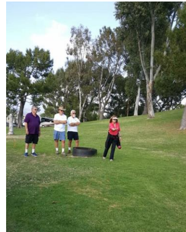
Playing bocce ball