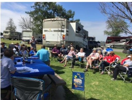
Saturday morning meeting with new sign in front