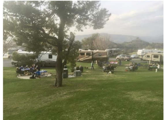
A different perspective