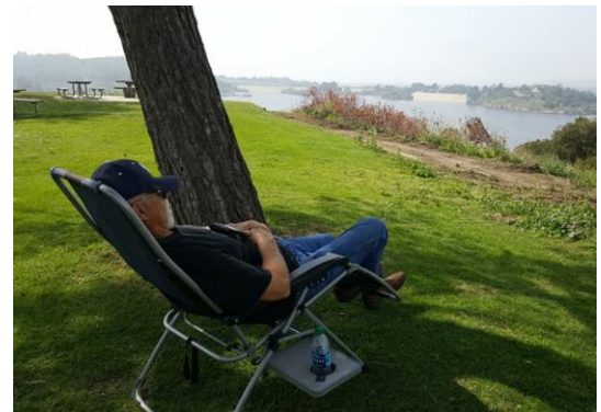
Enjoying the view or sleeping?