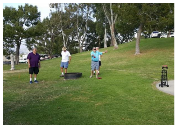
More bocce ball