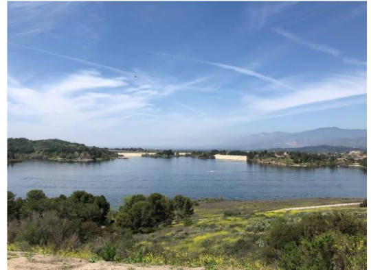
A beautiful view of Lake Puddingstone