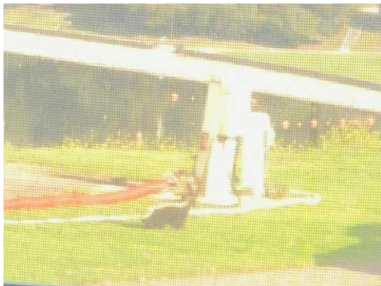
An uninvited black and white quest.