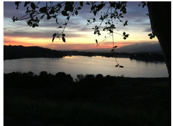
A gorgeous Puddingstone sunset